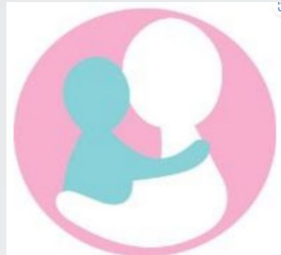
Paediatric Association of Serbia